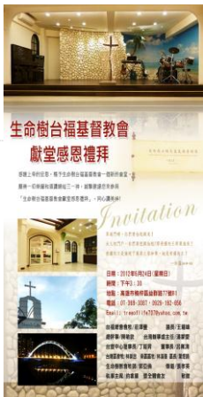
Tree of Life Church, Kaoshiung, 24.6.